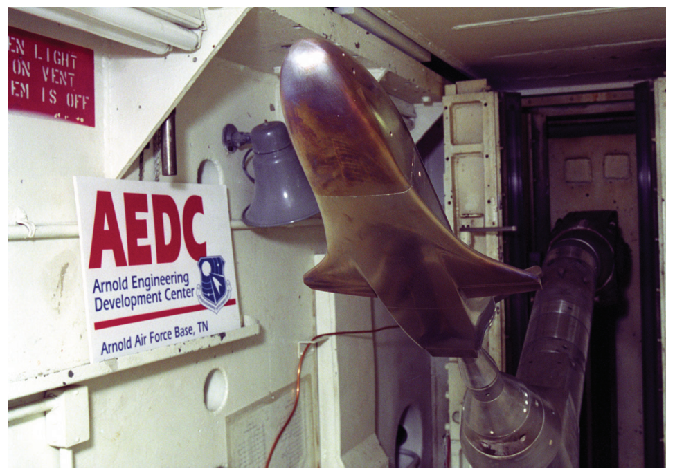
A 2001 wind tunnel test in VKF used a 6-percent scale model of Boeing's X-37 to investigate the aerodynamic forces.

Another example is a technical report written by AEDC Fellow Dr. Wheeler McGregor in 1976, titled