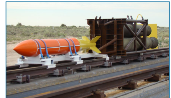
BLU-Fuze penetrator ready for sled test Holloman AFB, New Mexico

We must be diligent and disciplined in our efforts to transform the way we do business. We must be willing to leave our comfort zone, daring to be innovative and bold in meeting the needs of our customers. In doing so, we will become more valuable to our customers and our Nation.