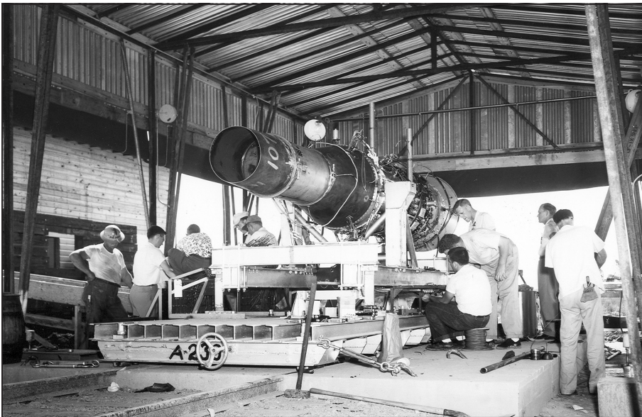
The first jet engine test at AEDC in 1953 required design and construction of a thrust stand for the J47 turbojet engine used in calibrating the T-1 high-altitude test cell. The J47 engine powered the B-47 bomber. (File photo)

"I find it fascinating personally, that our legacy goes back that far," said Lt. Col. James