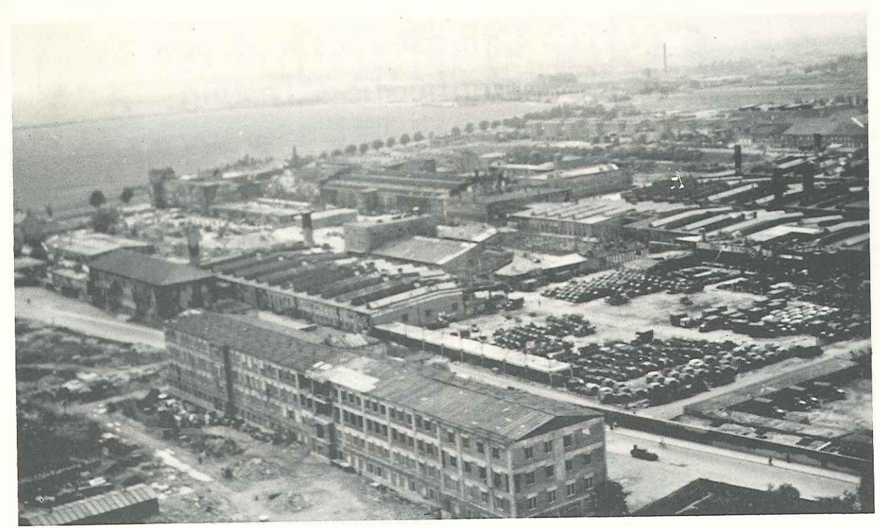
This 1945 photograph provides an overall view of the Bavarian Motor Works (BMW) plant which produced military vehicles for the German army. Tucked away in one section was a jet engine test unit with two high-altitude cells. One began operation in 1943, and the other was nearing completion as the war ended. A duplicate facility had nearly been completed at Stuttgart at this time.

development. Hydraulic power is recommended, and a new location such as Boulder Dam, Grand Coulee, etc., should be considered since the Wright Field area is now too restricted and the power is too limited. This would be especially desirable if German material could be made available to the AAF."